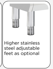
Higher stainless steel adjustable feet as optional